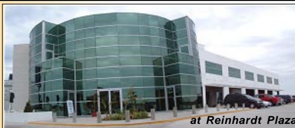
at Reinhardt Plaza

Home Buyer Newsletter : Welcome to the archives of the Sparta E-Mail or Print Newsletter, a series of informative articles about buying a home. This newsletter is published three times in a year. Become a more informed consumer by signing up now to receive the Sparta Home Buyer Newsletter via email. Also, by signing up for the Newsletter, you will receive Sparta 's New Community Alerts, keeping you aware of new community openings and home builders' limited time offers and special incentives.